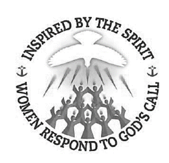
May our Lady of Good Counsel continue to guide and intercede for us as we carry on our faith filled endeavours for God and Canada.